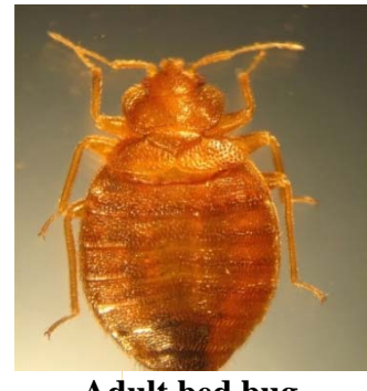
Adult bed bug

In most cases, pesticides and other control measures should not be applied until bed bugs are identified by an entomologist or other professional.