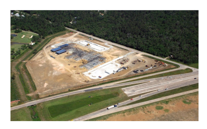
Remotely Located School