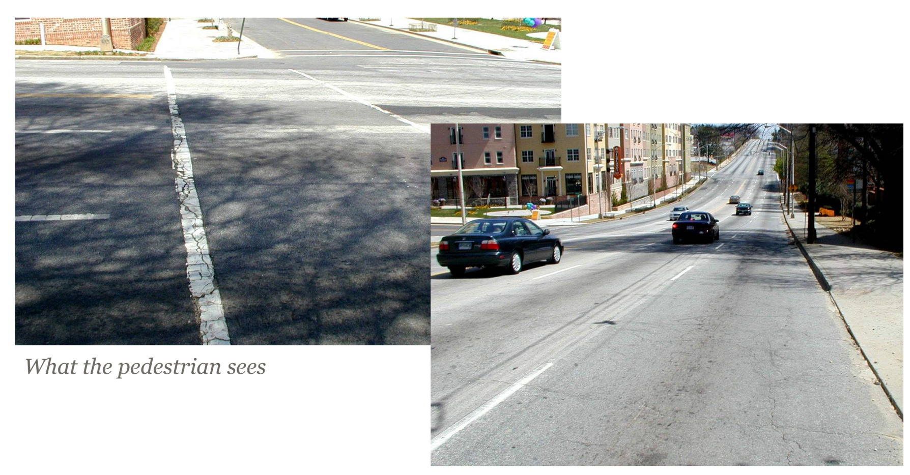
What the driver sees